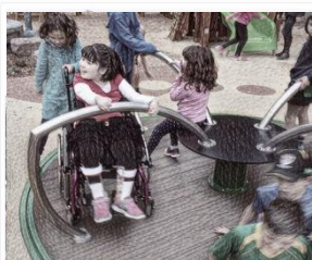
Bespoke All Abilities Handrails