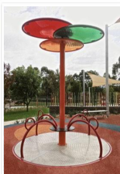
Sensory Shade Petals