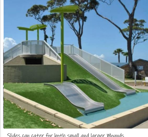
Slides can cater for both small and larger Mounds

This is a conceptual design only and may differ from manufacturing drawings. Colour is depicted only and should be referred to manufacture's colour swatches The copyright of this drawing remains with PlayEvolution Playgrounds and may not be reproduced without prior written consent. 2022 COPYRIGHT 235 ENTERPRISES PTY. LTD T/A PLAY EVOLUTION PLAYGROUNDS